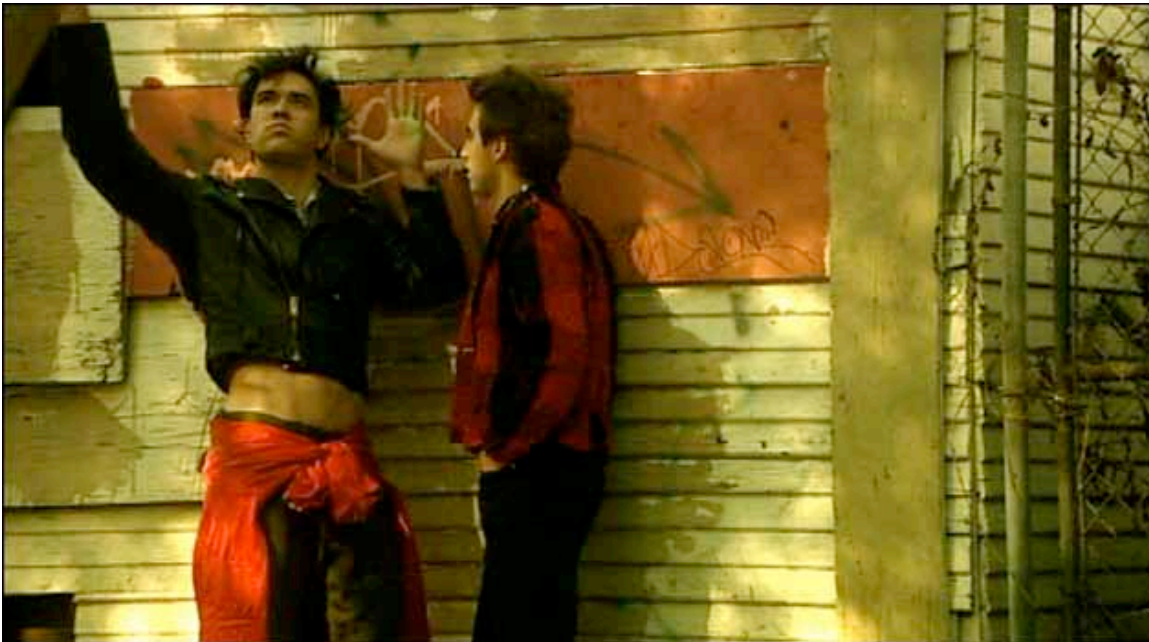
Scene from ‘FAQs’, 2005